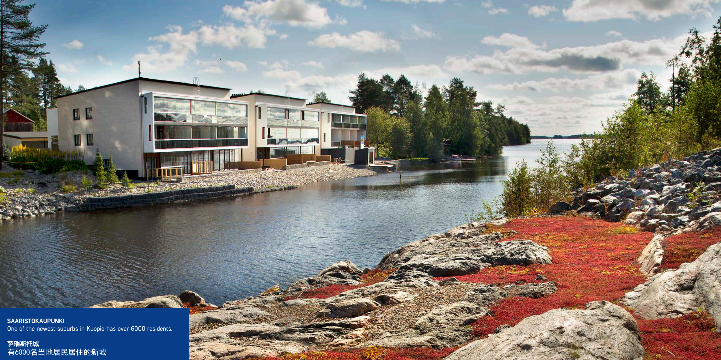
SAARISTOKAUPUNKI One of the newest suburbs in Kuopio has over 6000 residents.